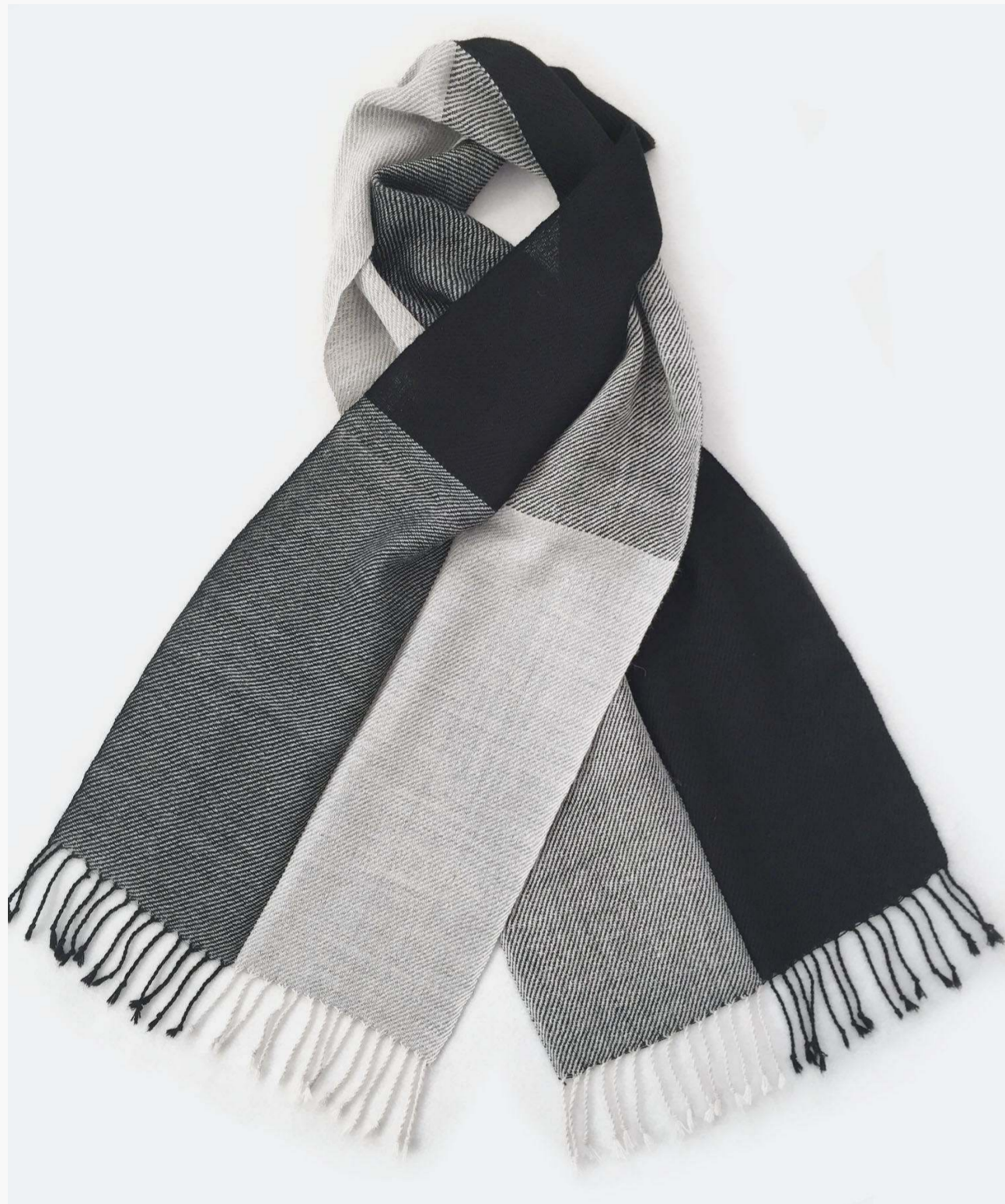
Scarf black, SC 300B Shawl heather, SH 300H Belt black 33mm, BE 330B