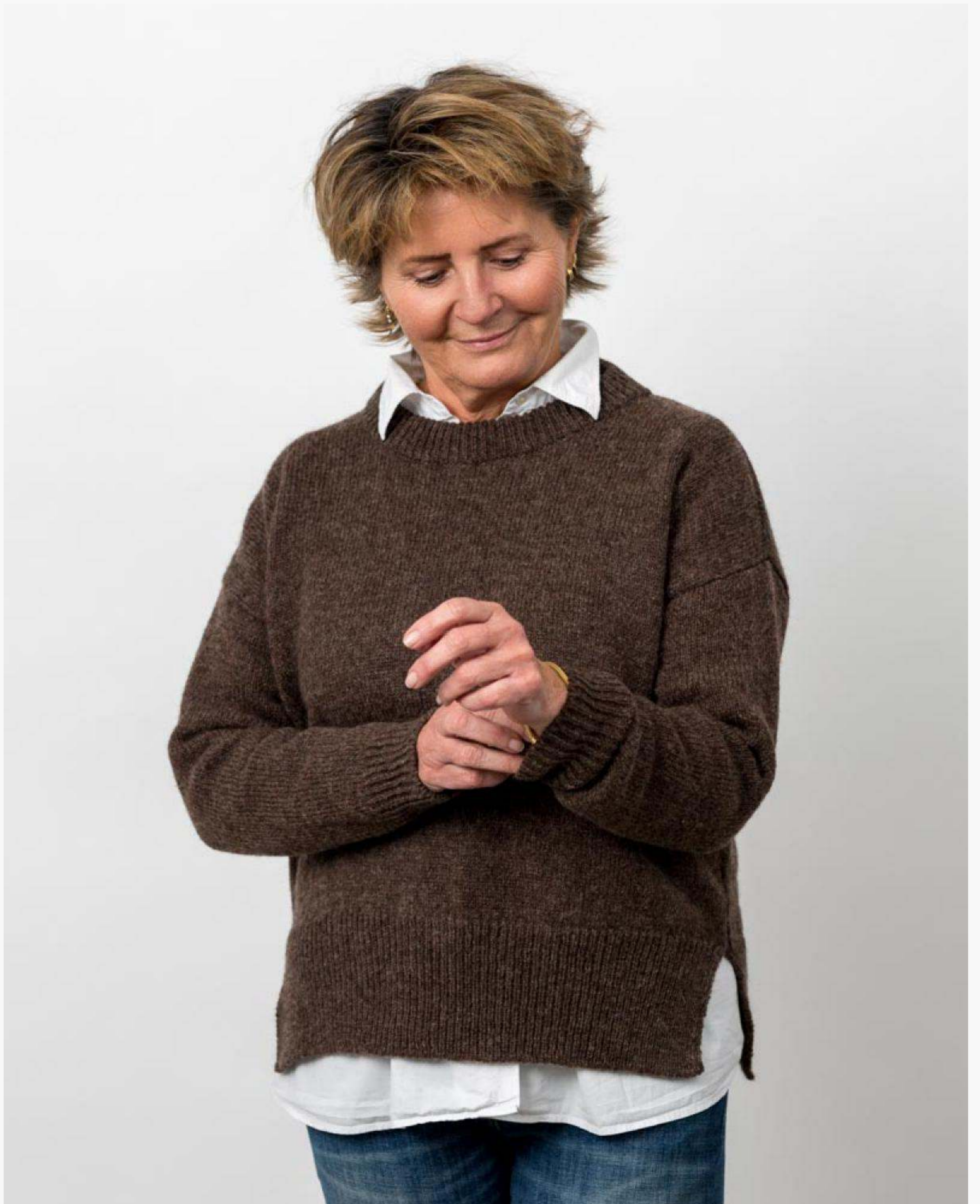
Sweater brown, KN 100B