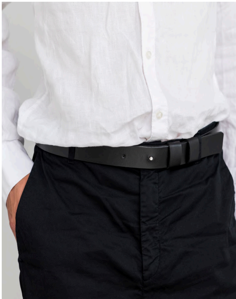
Belt black 33mm, BE 330B