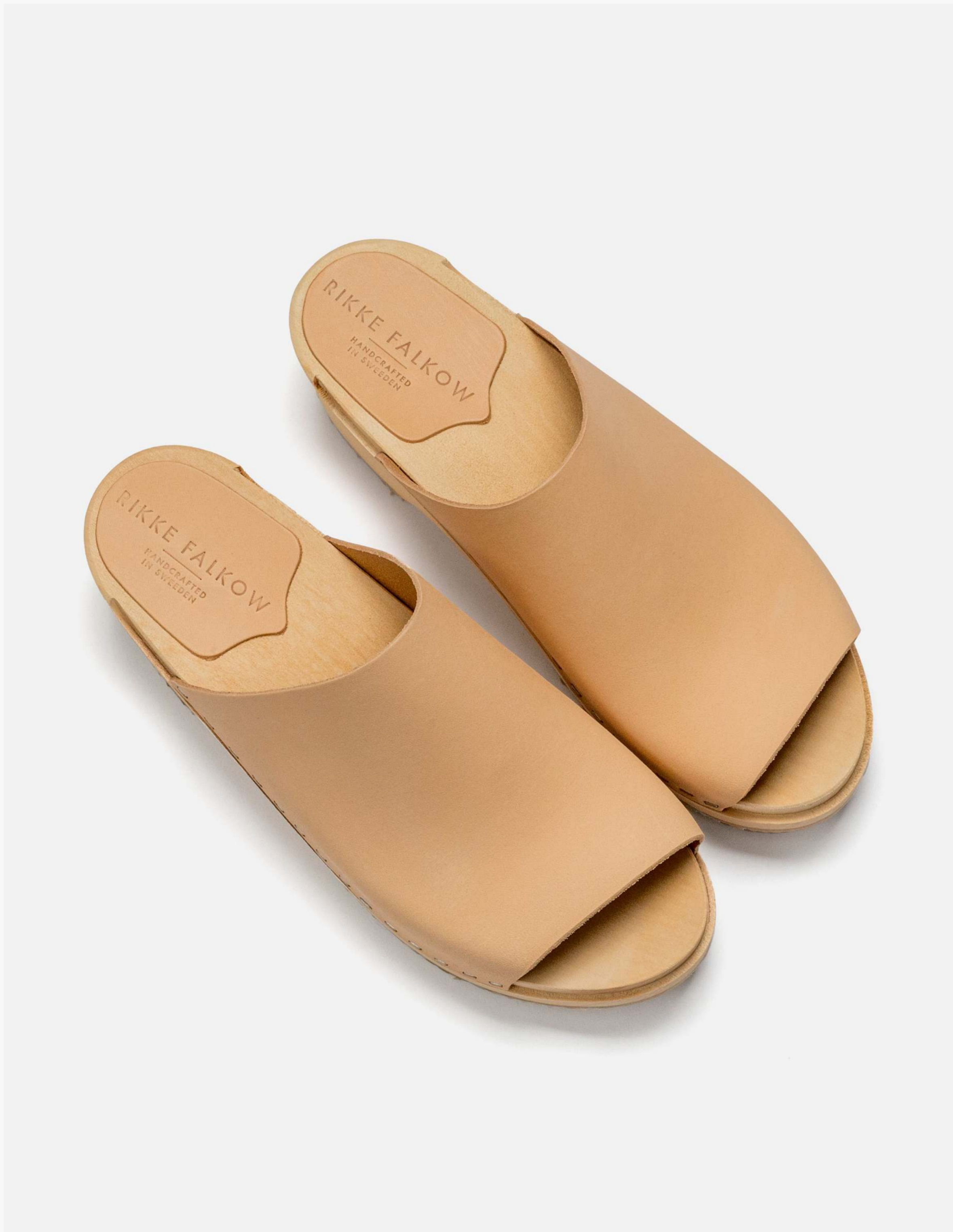
Clogs open nature, CL 300ON