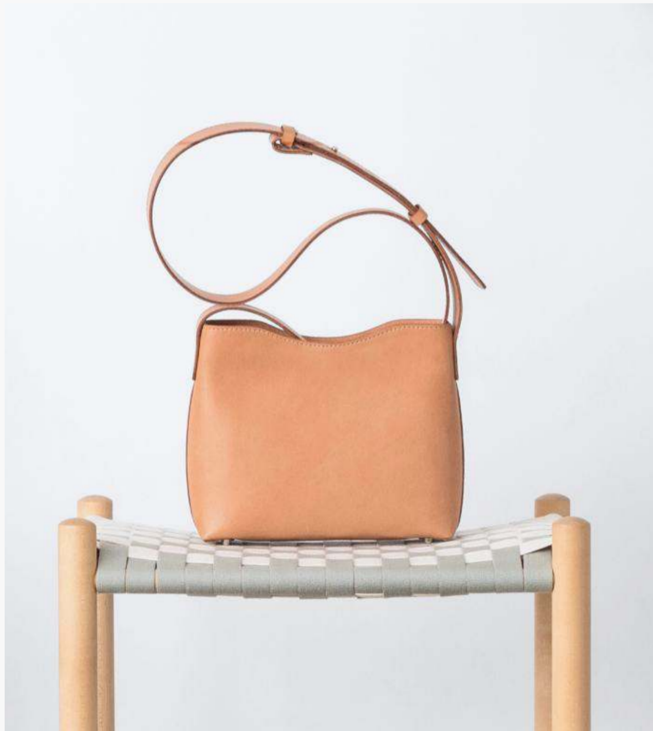
Shoulder bag nature, BA 150N Belt black 33mm, BE 330B