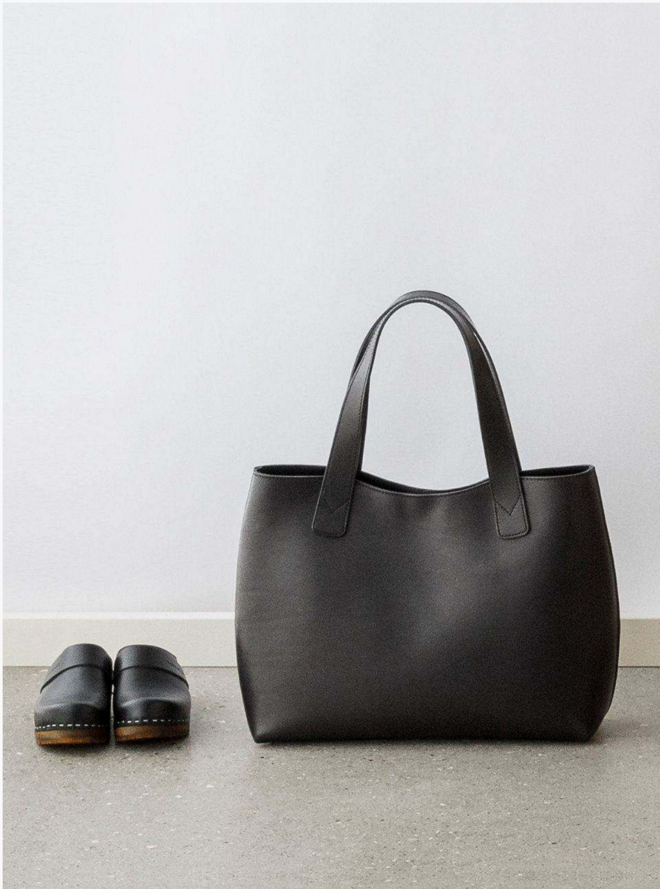
Bag large, BA 101B Clogs black, CL 300B