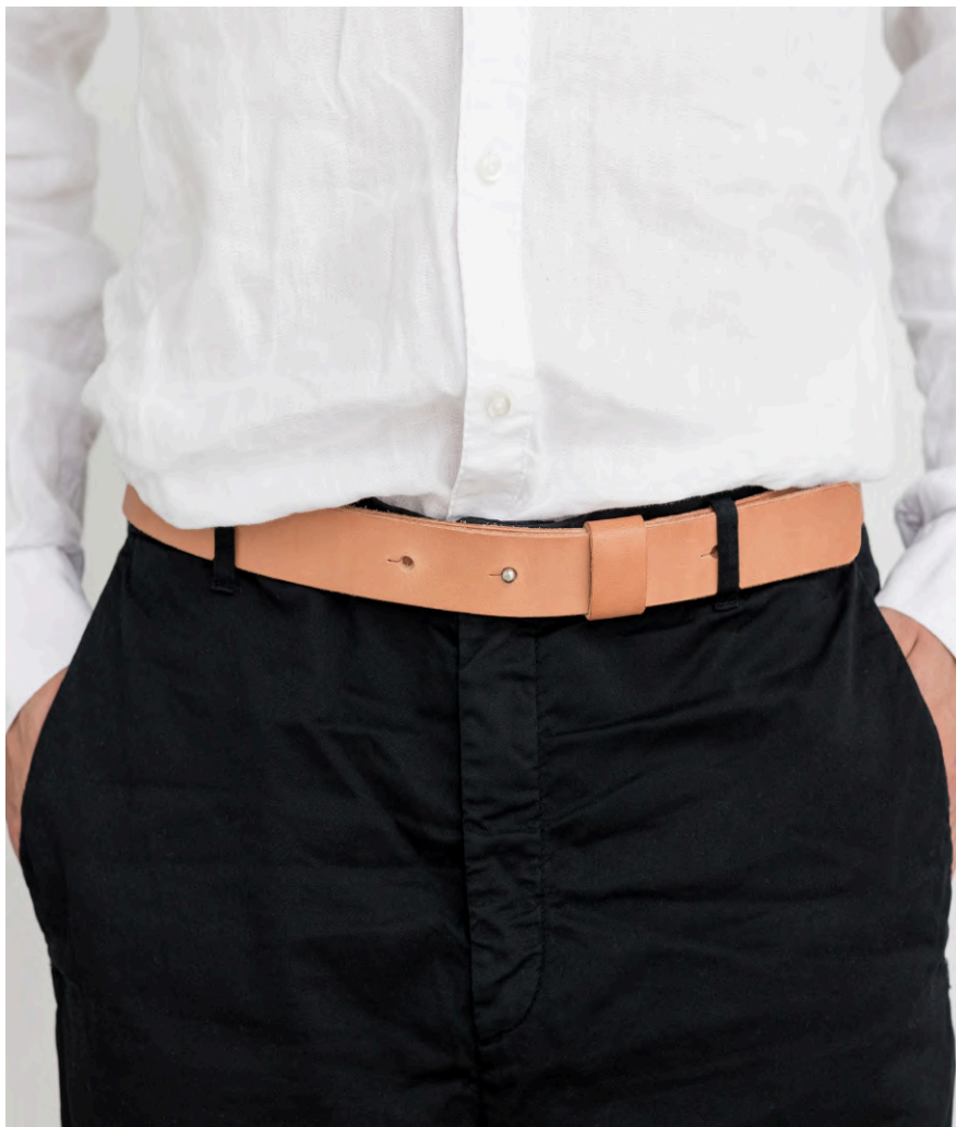
Belt 33mm, BE 330N