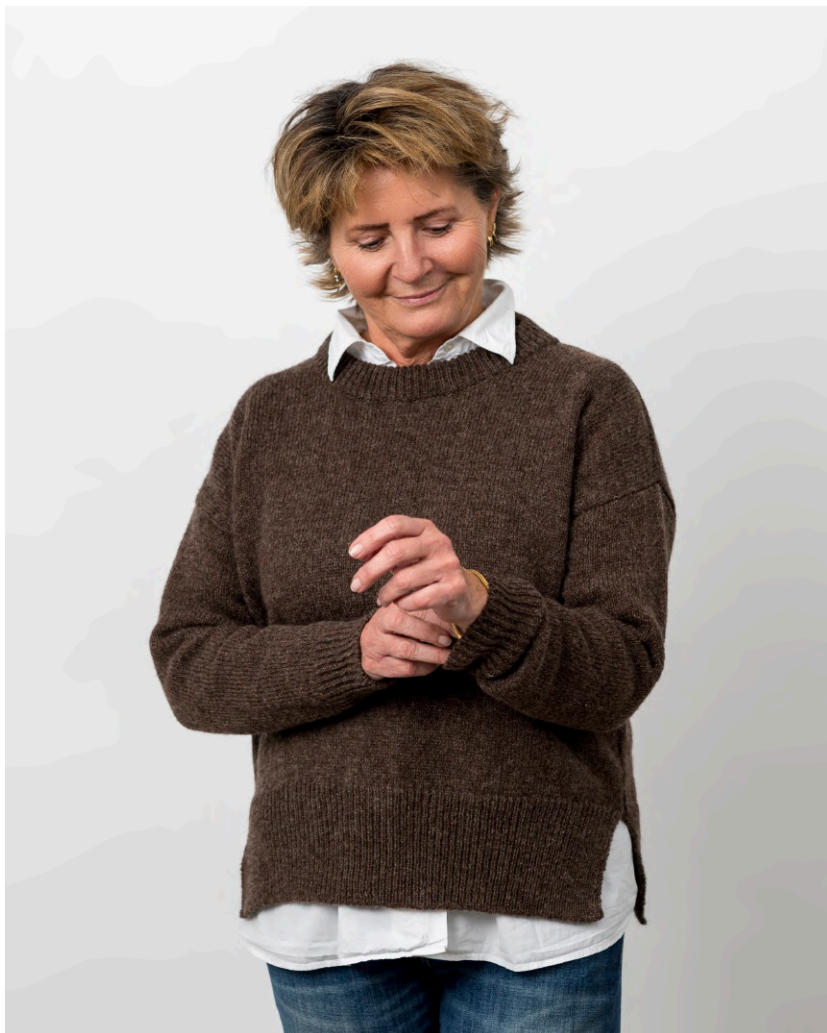
Sweater brown, KN 100B