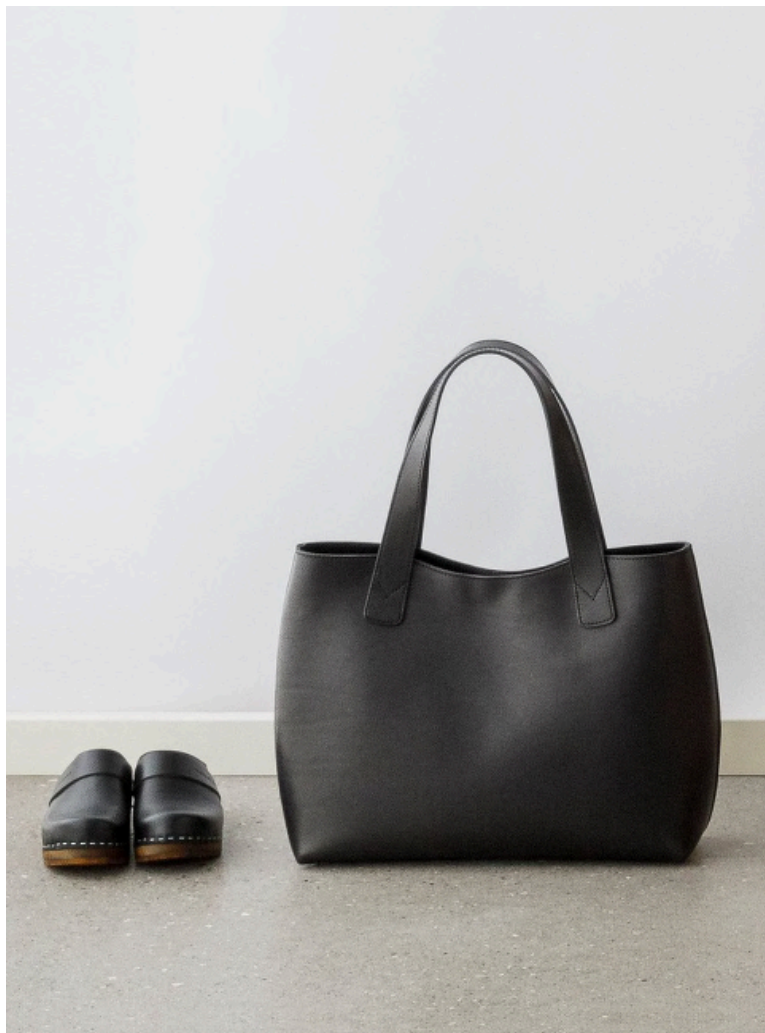
Bag large, BA 101B Clogs black, CL 300B