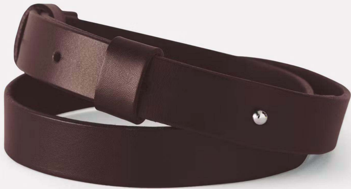
Belt dark brown 25mm, BE 250DB