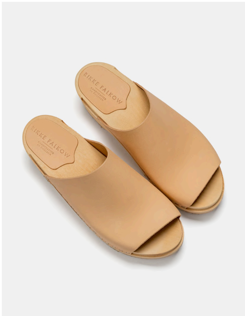
Clogs open nature, CL 300ON