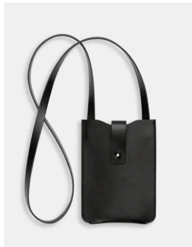
Phone bag black, BA 120B Phone bag nature, BA 120N