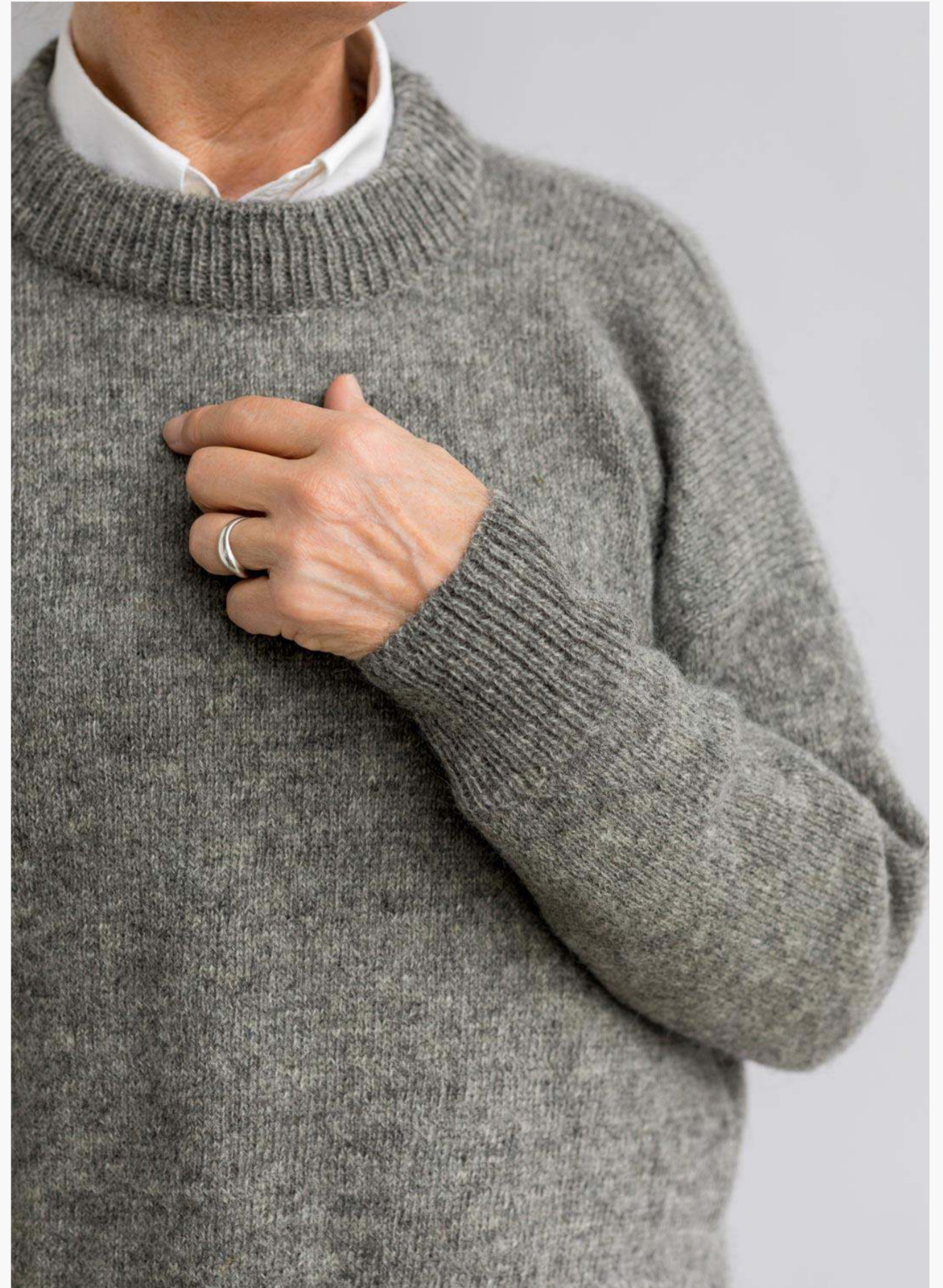
Sweater dark grey, KN 100DG Sweater medium grey, KN 100MG