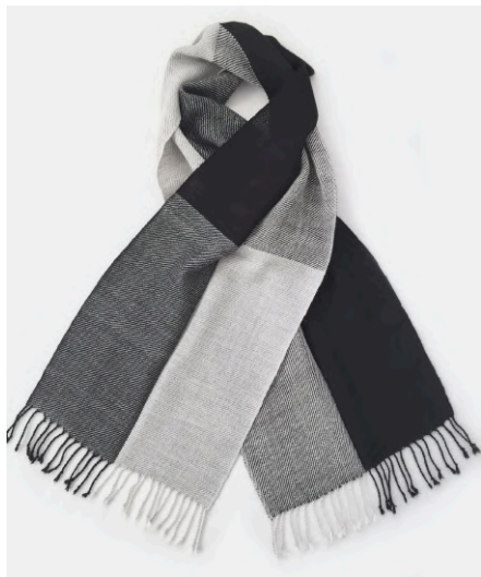
Scarf black, SC 300B Shawl heather, SH 300H Belt black 33mm, BE 330B