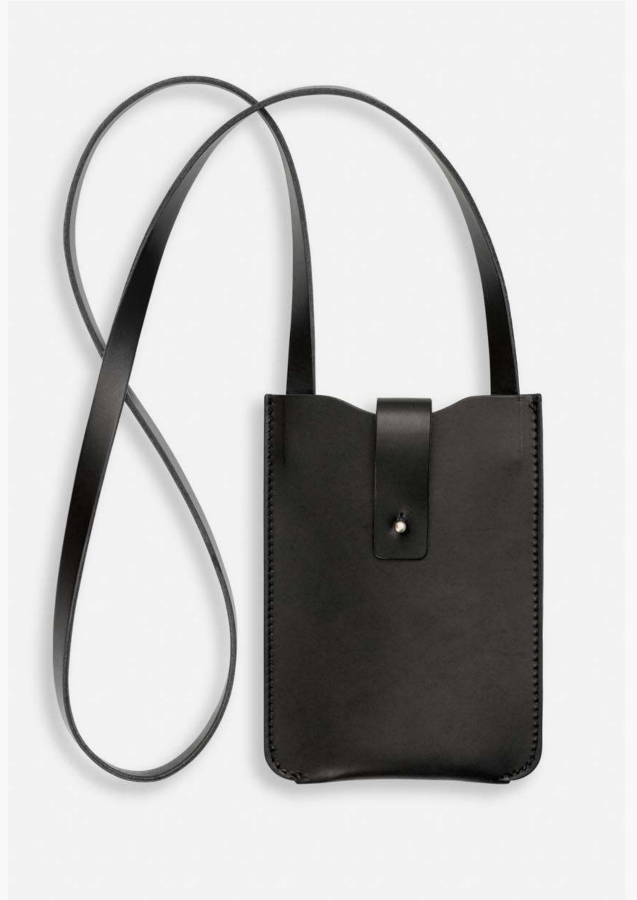
Phone bag black, BA 120B Phone bag nature, BA 120N