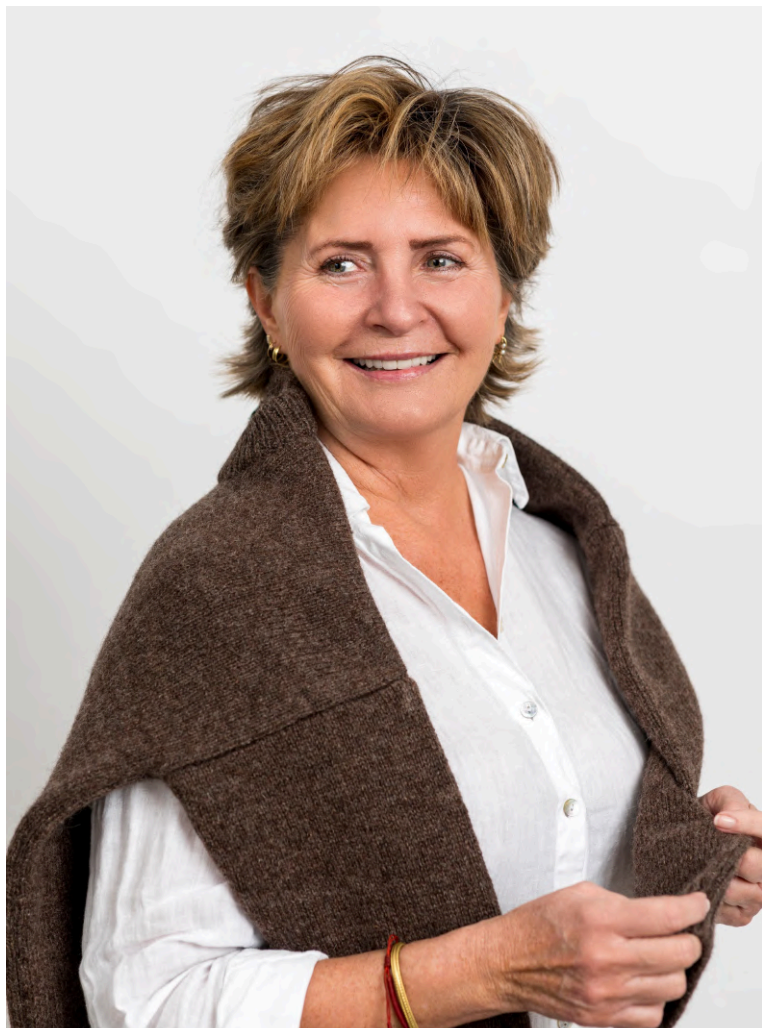
Sweater brown, KN 100B