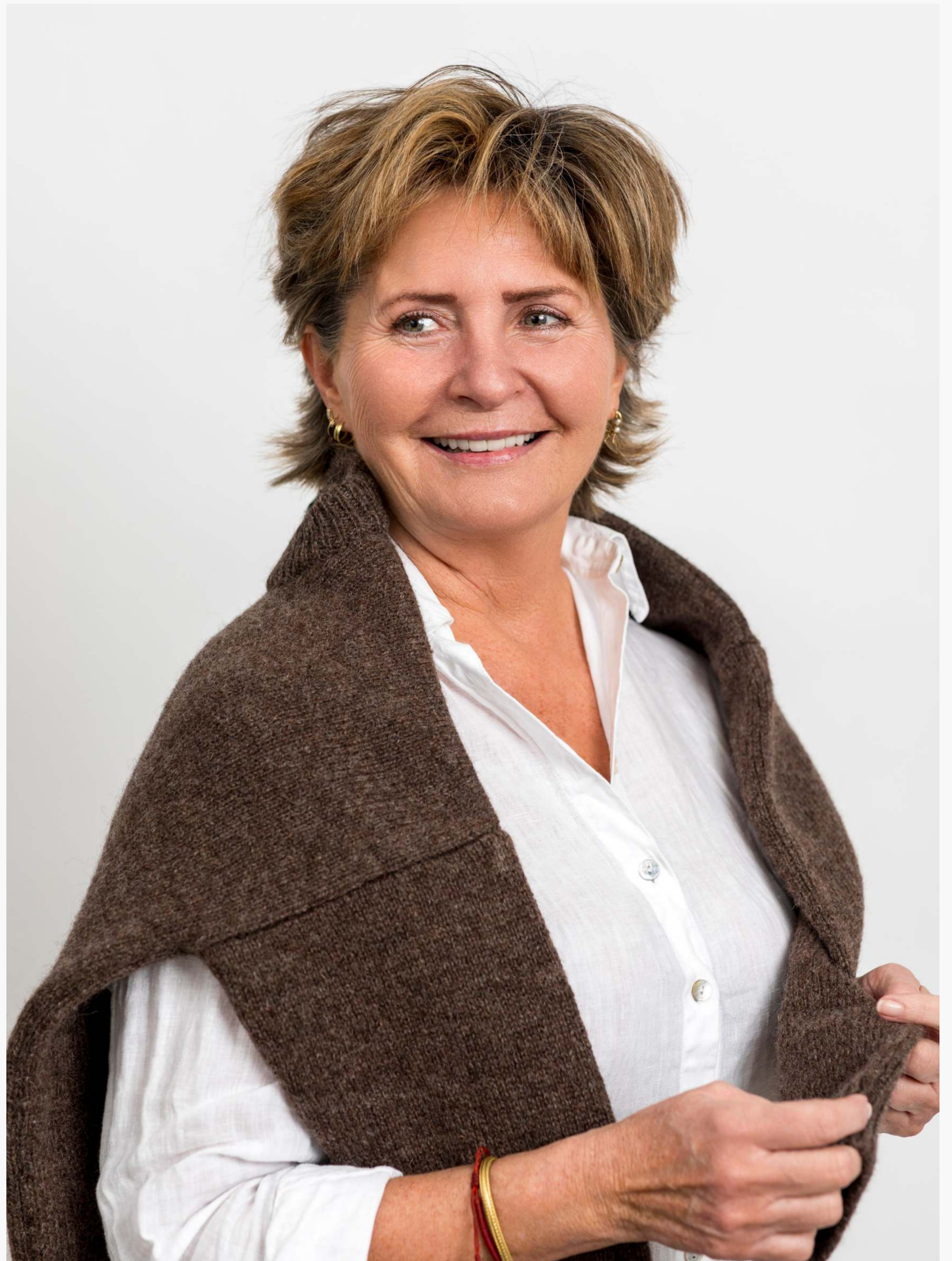
Sweater brown, KN 100B