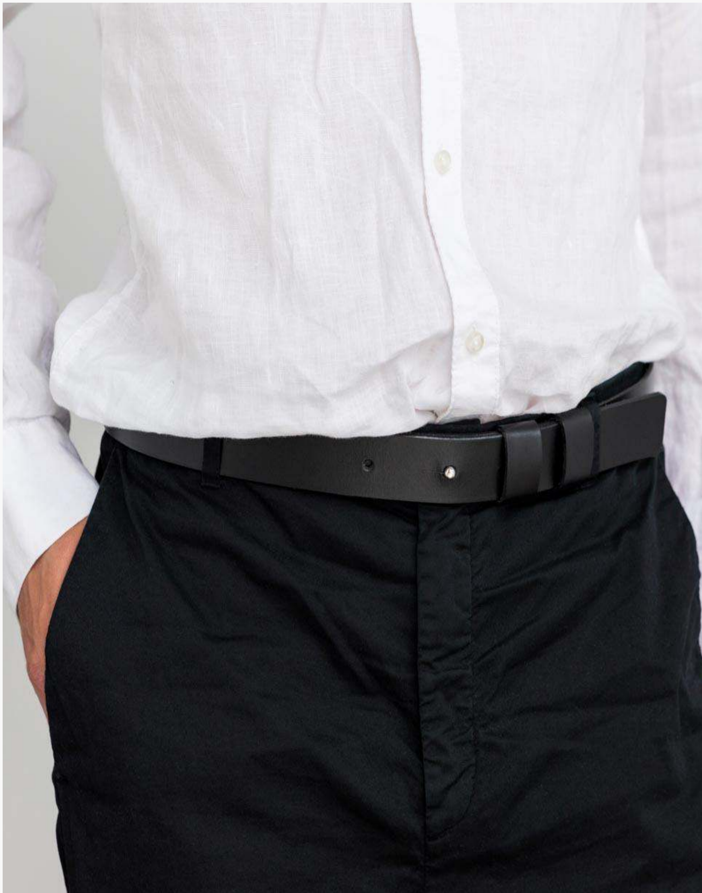
Belt black 33mm, BE 330B