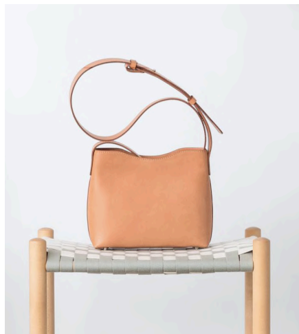
Shoulder bag nature, BA 150N Belt black 33mm, BE 330B