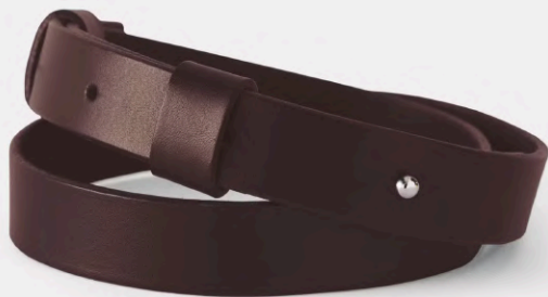
Belt dark brown 25mm, BE 250DB